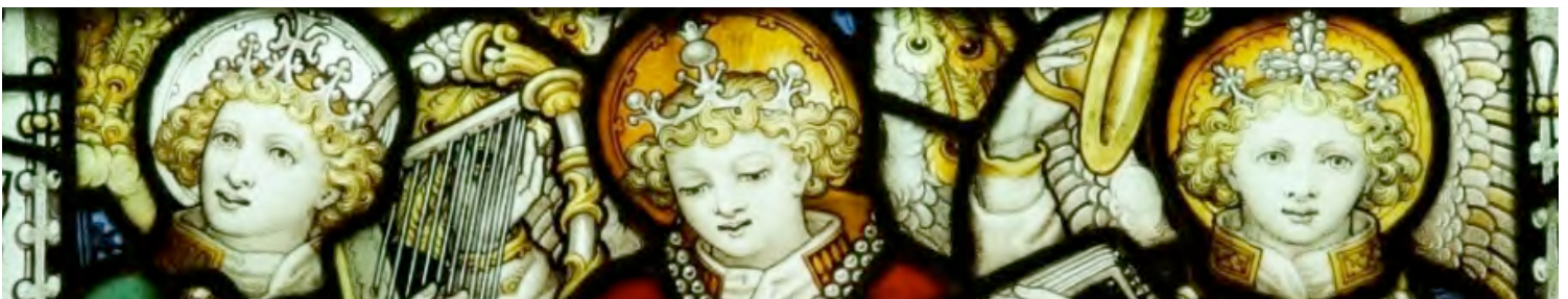
(above) Detail of window from North Aisle by C. E. Kempe and Co.

Annual membership will also rise in 2014.