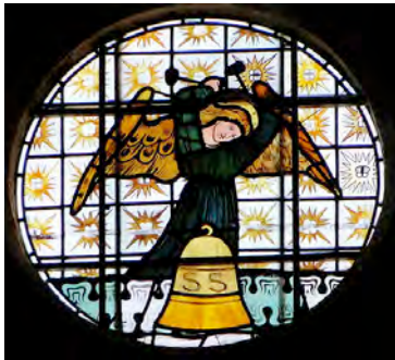
(above) 'Angel playing Bells' Edward Burne Jones