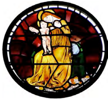
(above) "Virgin and child" Edward Burne Jones