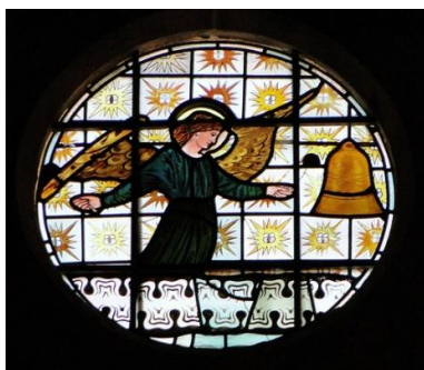
(above) 'Angel playing Bells' Edward Burne-Jones

All images of the stained glass at S. Michael's featured in this newsletter are from the West Window.