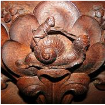
Misericord depicting a grasshopper riding on a snail