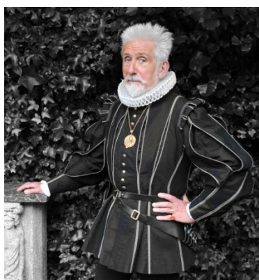
Sir Roy Strong