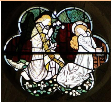
(above) 'The Annunciation' William Morris

Do bring your friends, who might be interested in joining our Friends, to our events. At £10 a year, £15 for joint membership, £100 for single life membership, and £150 for joint life membership, it is very good value.