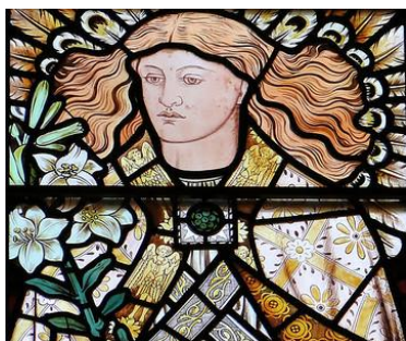
(above) 'St Gabriel' (detail) William Morris